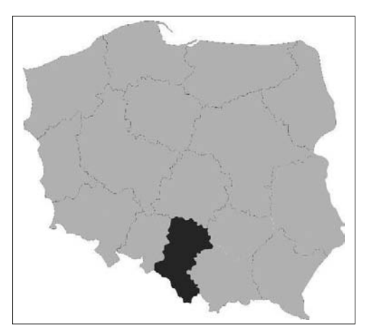
Figure 1. Location of the study area in Poland

Region of study. The Silesian province is located in southwestern Poland (Fig. 1) and constitutes nearly 3.9% of the country's area. The region is inhabited by almost 5,000,000 people, living in a high density of 393 people/km<sup>2</sup>. The region covers an area of varied landscape, from mountains through the woodlands to the urbanized areas. The region has numerous water reservoirs which supply water to the cities and towns.